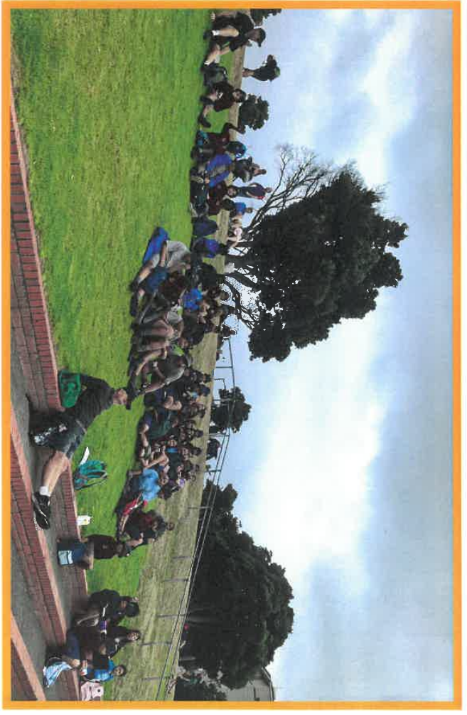
Basin Reserve. Thanks to cricket Wellington. Room 2 and a great day at the cricket on Friday at